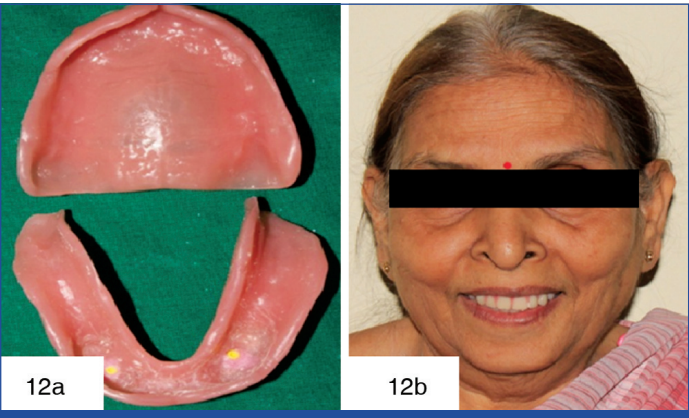
[Table/Fig-12]: a) Pick up of female retentive cap in final denture; b) Postoperative