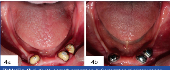
[Table/Fig-4]: a) 33, 34, 43 teeth preparation; b) Cementation of primary coping.

Impression for fabrication of primary coping was made with addition silicone (Flexceed). On poured cast wax patterns were fabricated for primary coping producing chamfer margin of 0.5 mm all around for secondary copings which was then checked on surveyor for parallelism. The primary copings were cemented using glass ionomer cement [Table/Fig-4b].