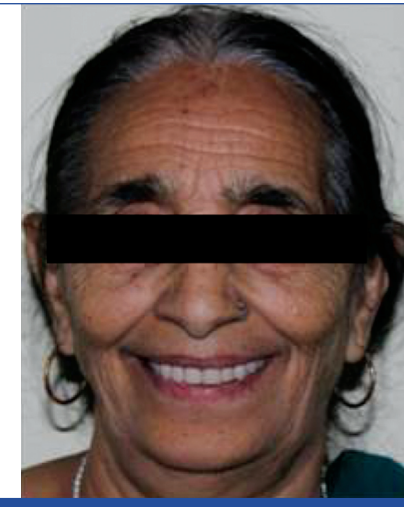
[Table/Fig-7]: Postoperative extra oral picture.