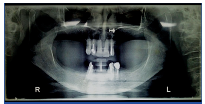
[Table/Fig-3]: Orthopantomogram (OPG) showing prefabricated metal post with 33, 34, 43.

Impression for fabrication of primary coping was made with addition silicone (Flexceed). On poured cast wax patterns were fabricated for primary coping producing chamfer margin of 0.5 mm all around for secondary copings which was then checked on surveyor for parallelism. The primary copings were cemented using glass ionomer cement [Table/Fig-4b].