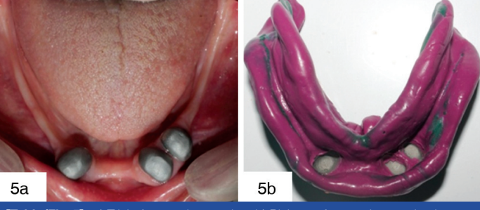
[Table/Fig-5]: a) Trial of secondary coping; b) Pick up of secondary coping in medium body impression.

Secondary copings with 0.5 mm chamfer margin were fabricated on primary coping and were sandblasted [Table/Fig-5a]. The sectional border moulding was done for maxillary arch with low fusing impression compound (DPI-Pinnacle). The lower arch impression was made using medium fusing elastomeric impression material (Reprosil dentsply Sirona) and pick up of secondary coping was done [Table/Fig-5b].