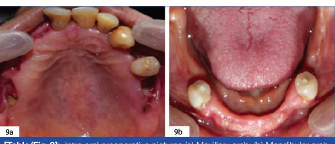
[Table/Fig-9]: Intra oral preoperative pictures (a) Maxillary arch; (b) Mandibular arch