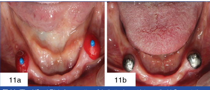
[Table/Fig-11]: a) Trial of wax pattern & ball attachment intra orally; b) Cementation